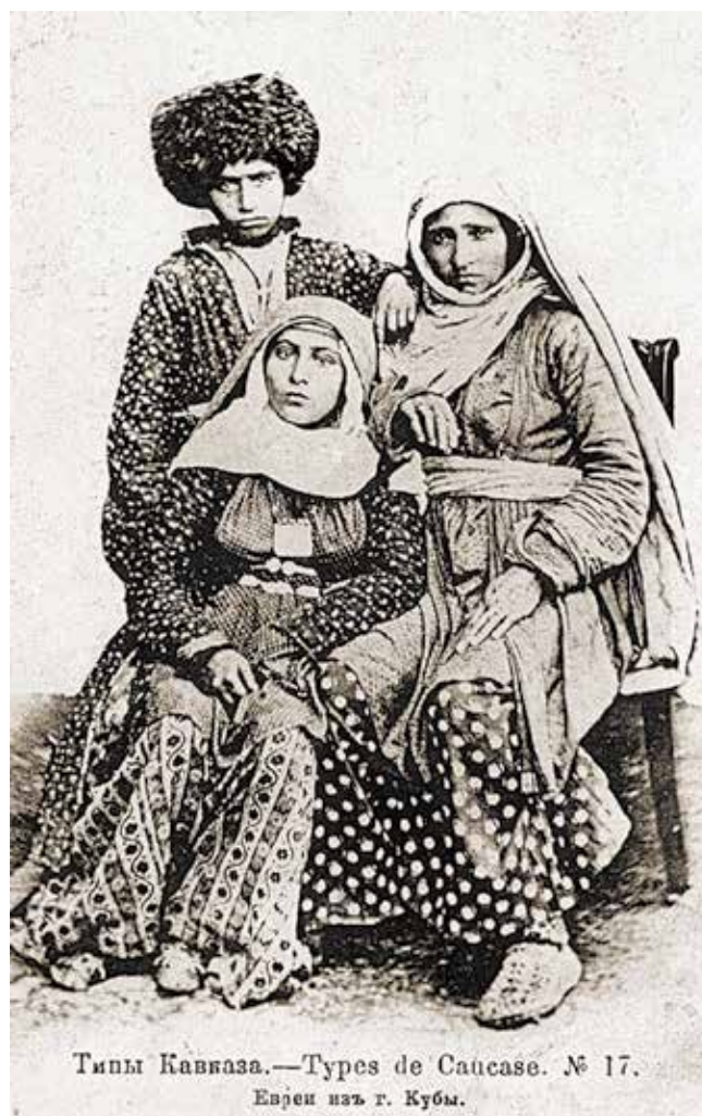
Jews from the town of Guba. Photo from the early 20th century

In light of these facts of the high activity of Jewish community representatives who were involved in all spheres of the political, economic and spiritual life of Azerbaijan, the number of this segment of the Azerbaijani people is of special interest to us. The section "The Population of Baku" reports the following figures. "According to the statistical department of the city council, the total population of the city of Baku on 1 January 1919 is 235,996 persons of both sexes. The average number of inhabitants of the city of Baku in 1916 was 225,490, in 1917 - 229,638 and in 1918 – 233,864 persons. According to the census of 22 October