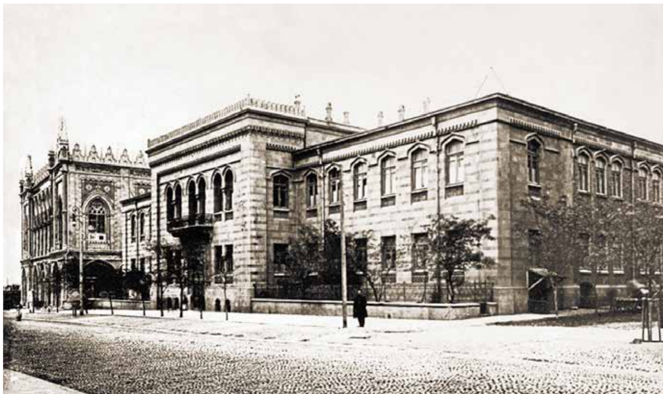
The building where the Parliament of Azerbaijan convened. Photo of the early 20th century