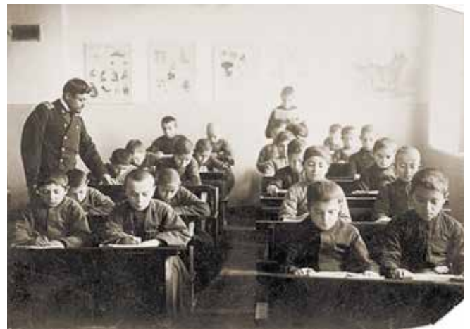
Elementary school in Baku. Photo from the early 20th century