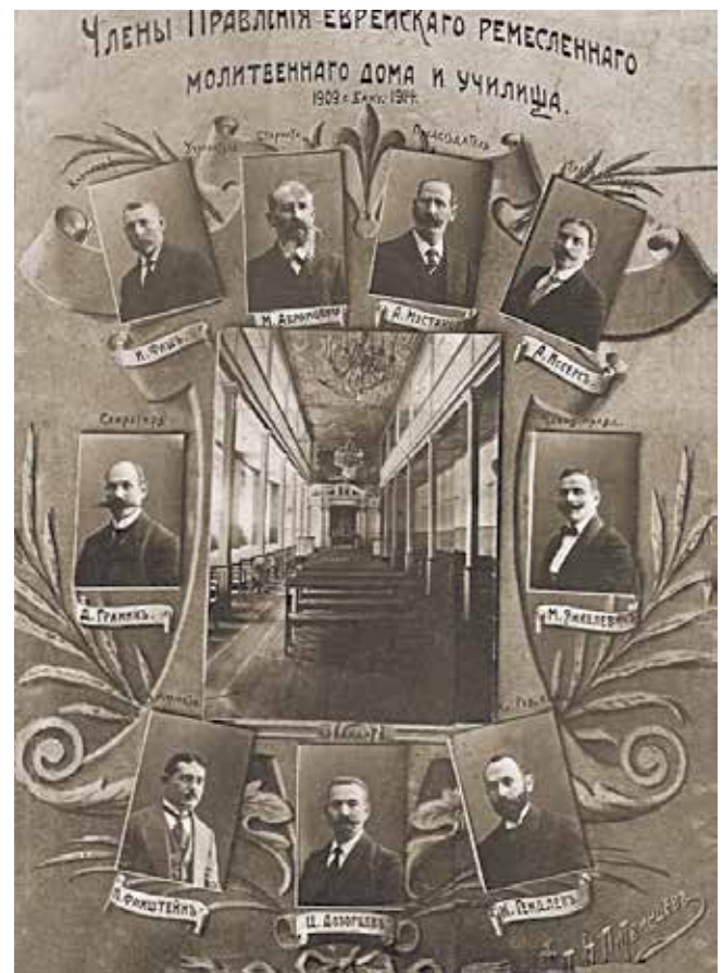
Members of the Jewish vocational school in Baku. Vignette of the early 20th century