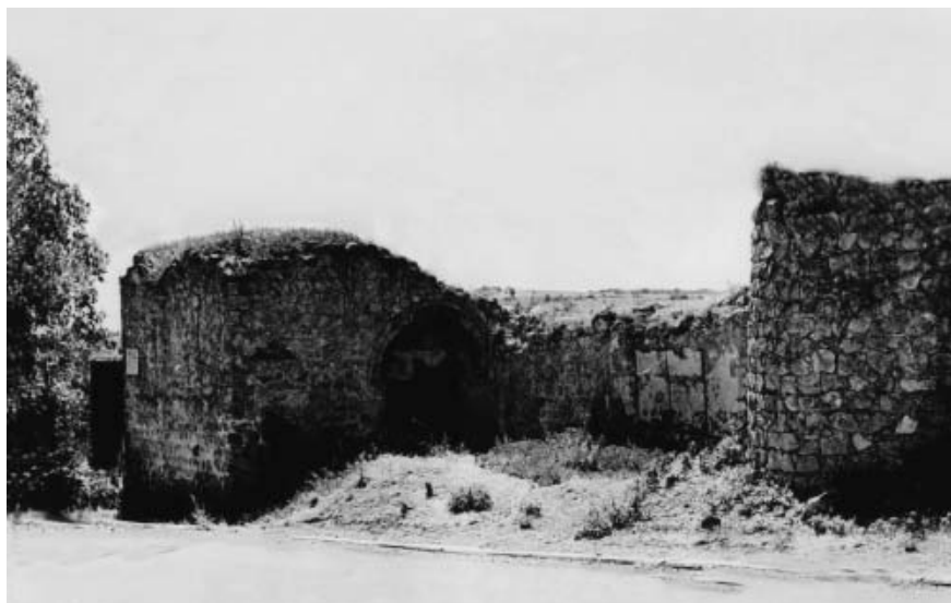
Panahali Khan's Castle. 18th century

In conquering Azerbaijan, Tsitsianov attached great importance to the seizure of Jar-Balakan communities who stood in the way of Russian