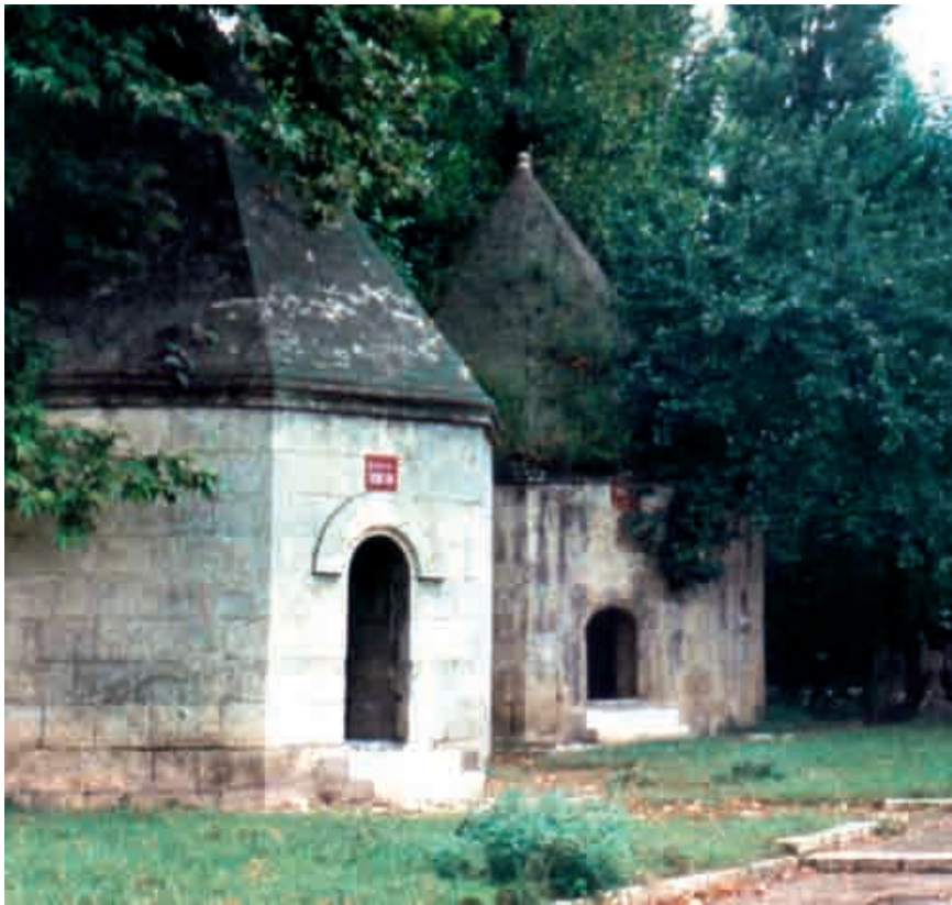
Panahali Khan's (18th century) and Ibrahim Khalil Khan's Tombs (19th century). "Imaret" Cemetery

said the same before he fell. I know how to keep my word. Nowhere in the world does a fly talk to an eagle; - the strong issue orders, while the weak are born to obey the strong... I call on you for repentance, not for obedience – I don't need it and if you want to be alive and well, do what I am telling you to do in this letter" (op.sit).