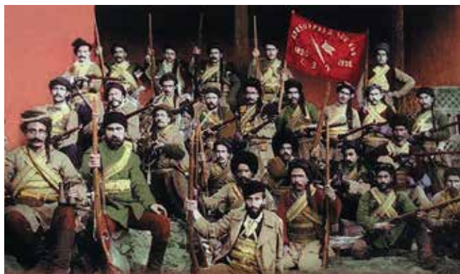
An Armenian squad fully equipped and armed with European and Russian weapons. While Europeans accused the Ottomans, Armenian parties created terrorist groups

the Ottoman Empire to sign an alliance agreement that would provide for the protection of Asian lands (7, p. 5). It was decided to sign the new agreement in Berlin. The Ottoman Empire hoped that Britain would support it in Berlin. But Britain decided to make threats at the Berlin Congress as it was aware of the tense situation of the Ottoman Empire and managed to take the island of Cyprus from the Ottoman Empire temporarily. According to the agreement signed on 4 June 1878 and approved by Abdul Hamid II on 15 July 1878, the Ottoman government would conduct reforms for the Armenians living in Eastern Anatolia in coordination with Britain. Britain would keep Cyprus until the Russian threat was eliminated in Eastern Anatolia. Thus, Britain guaranteed the security of the shortest way to India (9, p. 15). Apparently, Britain sought reforms not to protect the Armenians, but to protect its own interests and seized the island of Cyprus as a base against Russia.