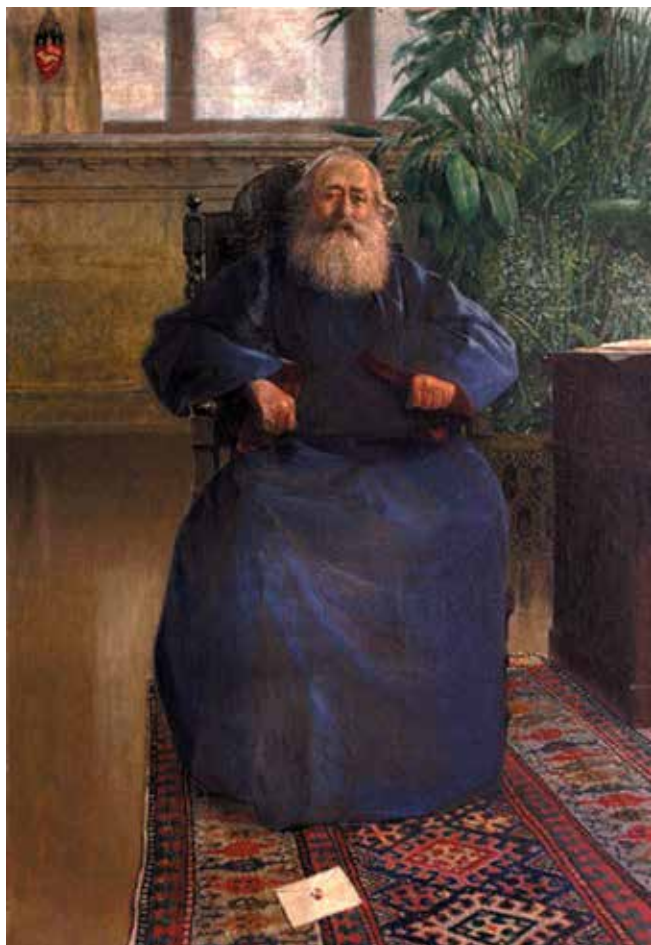
Catholicos Mkrtych Khrimyan. Artist V. Surenyants. 1909. M. Khrimyan headed the Armenian delegation sent to the Congress of Berlin. But because of the huge demands, the Congress did not receive the Armenian delegation

think it important to take a look at the history of relations between the British and Armenians.