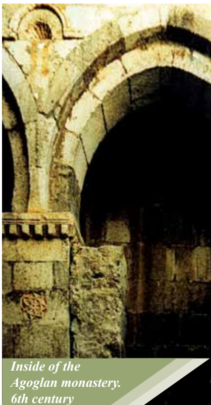
Inside of the Agoglan monastery. 6th century

and bone carving. For the level of its economic development, Karabakh was not behind any other region of Asia. As was the case in other parts of Albania, various cities of Karabakh thrived as handicraft and transit trade centers. The cities were also noted for being the concentration of public and political life 5 .