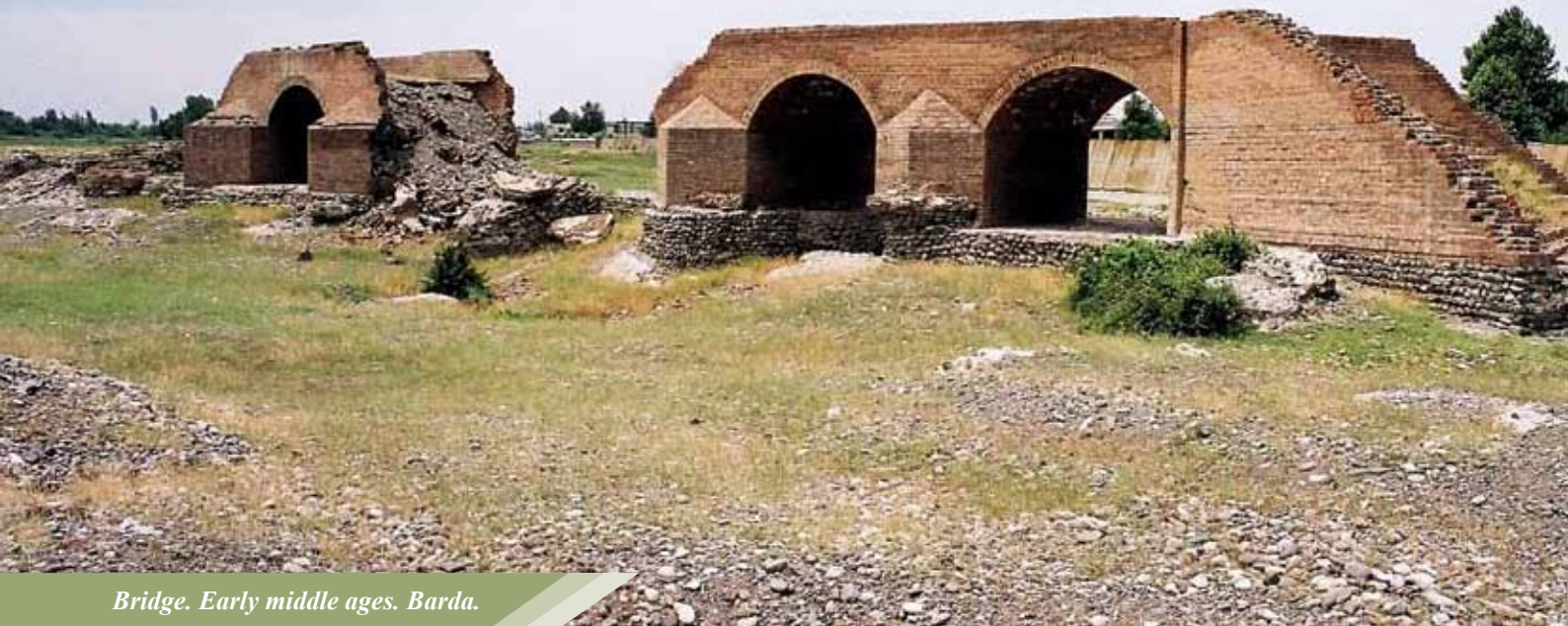
Bridge. Early middle ages. Barda.

the Dnepr and Don 14 . Karabakh was a destination for trade caravans from many countries, mainly Europe and the East. Karabakh markets were a popular transfer point and played an important part in the development of this part of Azerbaijan. This is why a large number of copper, silver and golden coins and five major hoards have been discovered here. A research of the coins has revealed that a local caulking iron appeared here in ancient times and existed until the 15 th century. Coins of many other countries were discovered in Karabakh as well, which is evidence of its participation in international commerce 15 .