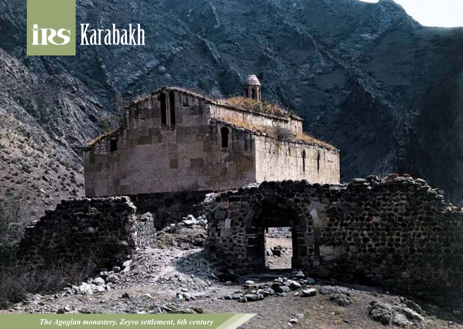
The Agoglan monastery. Zeyva settlement, 6th century