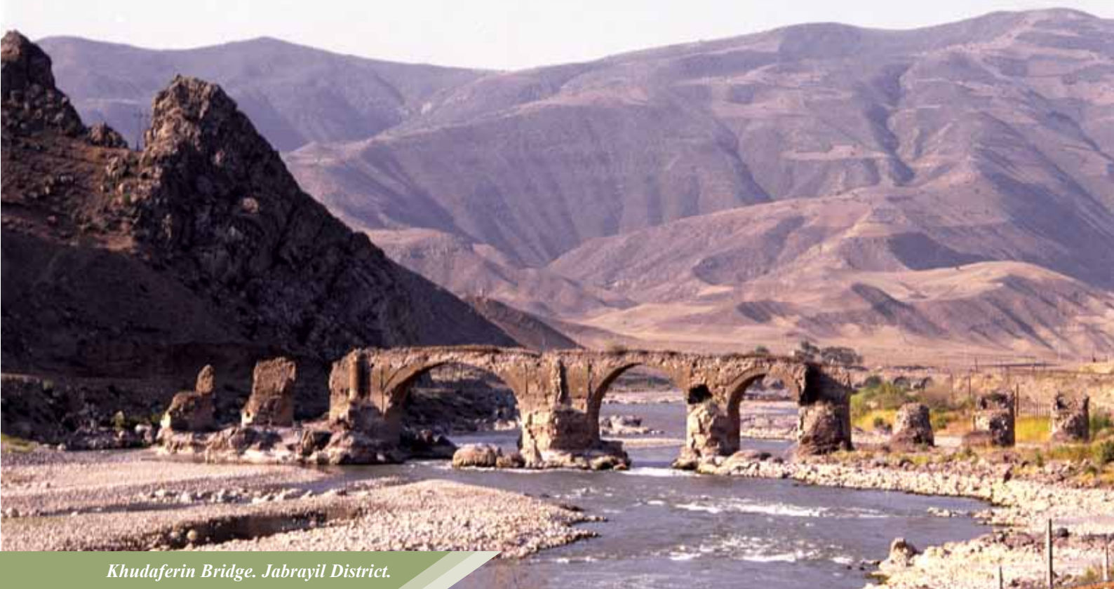
Khudaferin Bridge. Jabrayil District.

his son Ali Lashkari ascended to power in 971 and the Shaddadids established control over the whole of Aran. Soon afterwards, taking advantage of the weakening of the Shaddadids, Shirvanshahs captured part of Karabakh in 982, but in 993 ruler Al-Fadl I bin Muhammad Shaddadid re-gained control over Karabakh 22 . 🌱