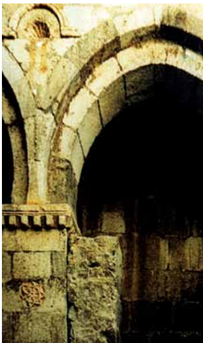
Inside of the Agoglan monastery. 6th century

and bone carving. For the level of its economic development, Karabakh was not behind any other region of Asia. As was the case in other parts of Albania, various cities of Karabakh thrived as handicraft and transit trade centers. The cities were also noted for being the concentration of public and political life 5 .