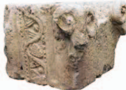
Capital. Early middle ages. Barda.

In the 6 th century Albania was at the center of war among the Sassanid, Byzantium and Khazars. According to a 591 agreement between the Sassanid and Byzantium, Albania found itself under the rule of Shahanshahs who eliminated the local dynasty. As was the case elsewhere in the Caucasus, Alba-