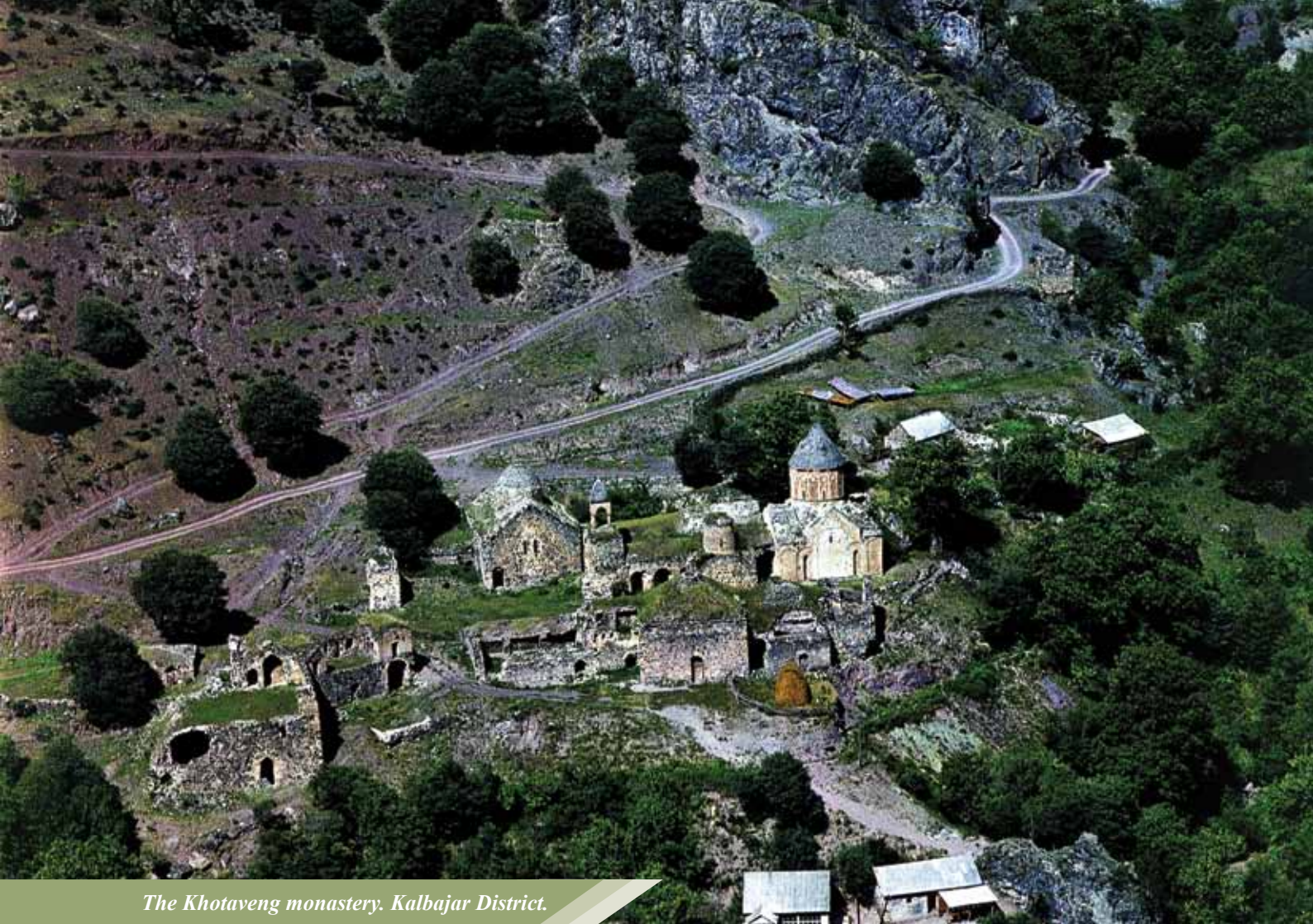
The Khotaveng monastery. Kalbajar District.

Uti (with the city of Partav, present-day Barda, which was the capital of Albania and residency of the Albanian Catholicos), Gardman (on the border with Iberia), Artsakh (present-day Nagorno-Karabakh and part of the Mil steppe), Sunik, Sisakan or Zangezur (south of Artsakh) 1 .