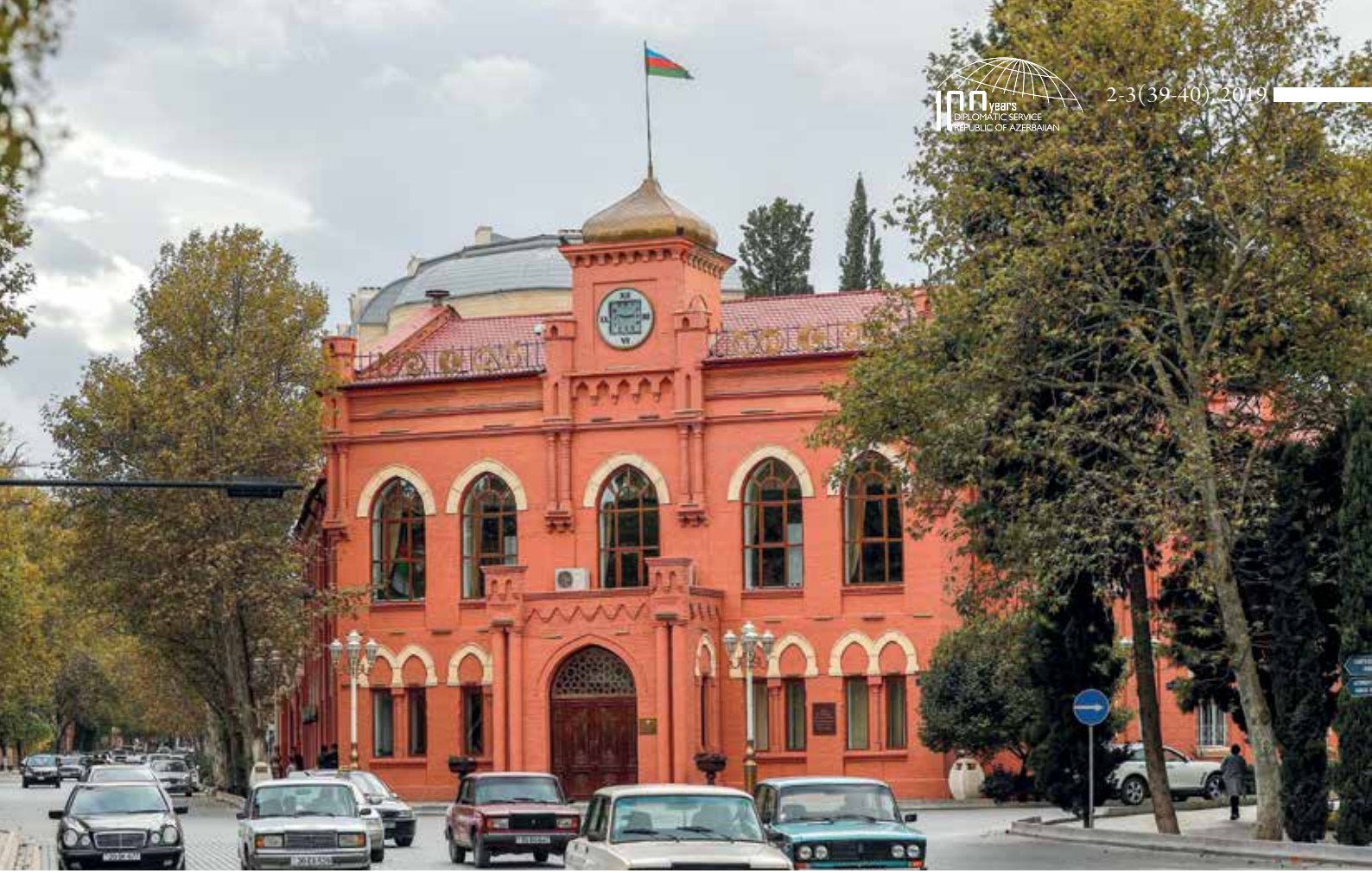
This building was the seat of government of the Azerbaijan Republic, including the Ministry of Foreign Affairs, in June-September 1918. Ganja, present-day photo