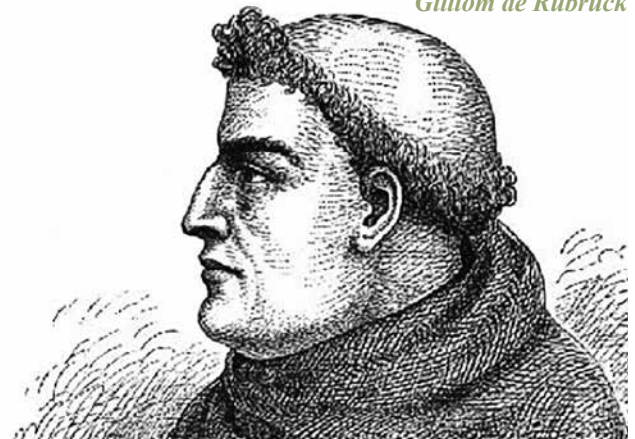
Gilliom de Rubruck

Rubruck turned southward from Sarai on the Volga, crossing Derbent, Shamakhi, the Mughan steppe and Nakhchivan. Rubruck further reached Erzurum, Cilicia, Cyprus, Antioch, and Tripoli, arriving at this destination by August 15, 1255 whence he sent a message notifying King Louis IX that he had fulfilled his mission. Rubruck cited a number of facts regarding the parts of the Caucasus he traversed during his trip, providing descriptions of Derbent, Ganja, Shamakhi and Nakhchivan and information about the activities of the local population.