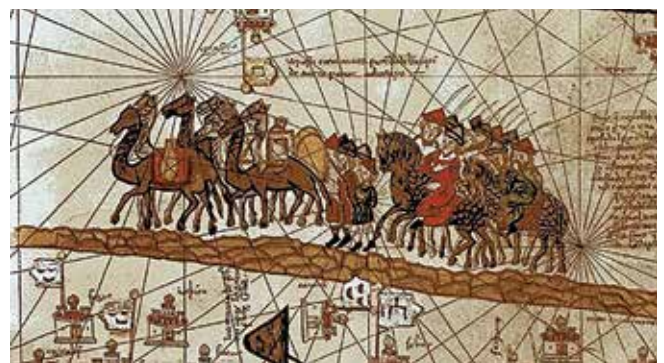
A caravan on the Great Silk Road. Medieval miniature painting