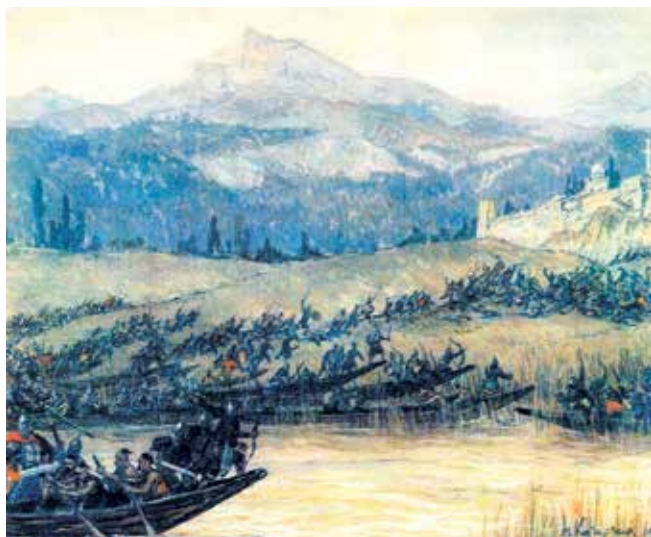
Russian attack on Barda. X c. Only by creating a navy, did the State of the Shirvanshahs manage to stop the Russian invasion

small sail called "walk-sail" and went into some bay (15, p. 42). In the 17 th century, English ships, which differed from "eastern" ships with their greater strength and reliability, also sailed in the Caspian Sea (16, pp. 28, 17, p.151).