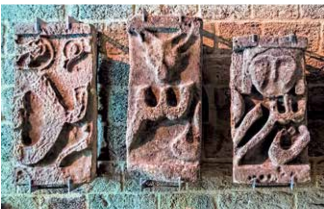
Facing stones of Sabayil Castle. 13 th century. The Palace of the Shirvanshahs historical-architectural complex

a foremast and a mainmast, oblique sails with inclined edges and up to 15-20 pairs of oars, while their contours outwardly resembled those of a galley. The search for analogues among the ships of other Muslim countries led us to a "Shebeke"-type ship (Arab.). Shebeke was a sailing-rowing vessel used for military purposes in the 7 th -18 th centuries (in the Persian Gulf, shebekes are still common). The hull of the ship was made of acacia or teak wood with the stems attached to the keel, the shell had a safety margin due to the frames and sealing cable in the grooves between the boards of the hull. Instead of nails, wood spikes were used, since Muslims believed that there was a kind of super magnet on the seabed that pulled metal parts out of the hull. The stern was adorned with carvings and was regarded as a visit card of the ship. Small shebekes had two, and more advanced large shebekes of the 15 th -17 th centuries in the Persian Gulf and the Mediterranean Sea - three masts with inclined edges and oblique sails (8, pp. 88, 89). The nose decoration (it was always available on all shebekes), perhaps, resembled the head of a bull. This image is most often found on Shirvan buildings in the 12 th -13 th centuries. On the shebekes of Shirvan there was a steering wheel and a tiller. It is known that they had been used in the East since the 11 th century and in the West since the 12 th century (9, p.30). According to travelers, of all Caspian types of ships only the "fish"-type