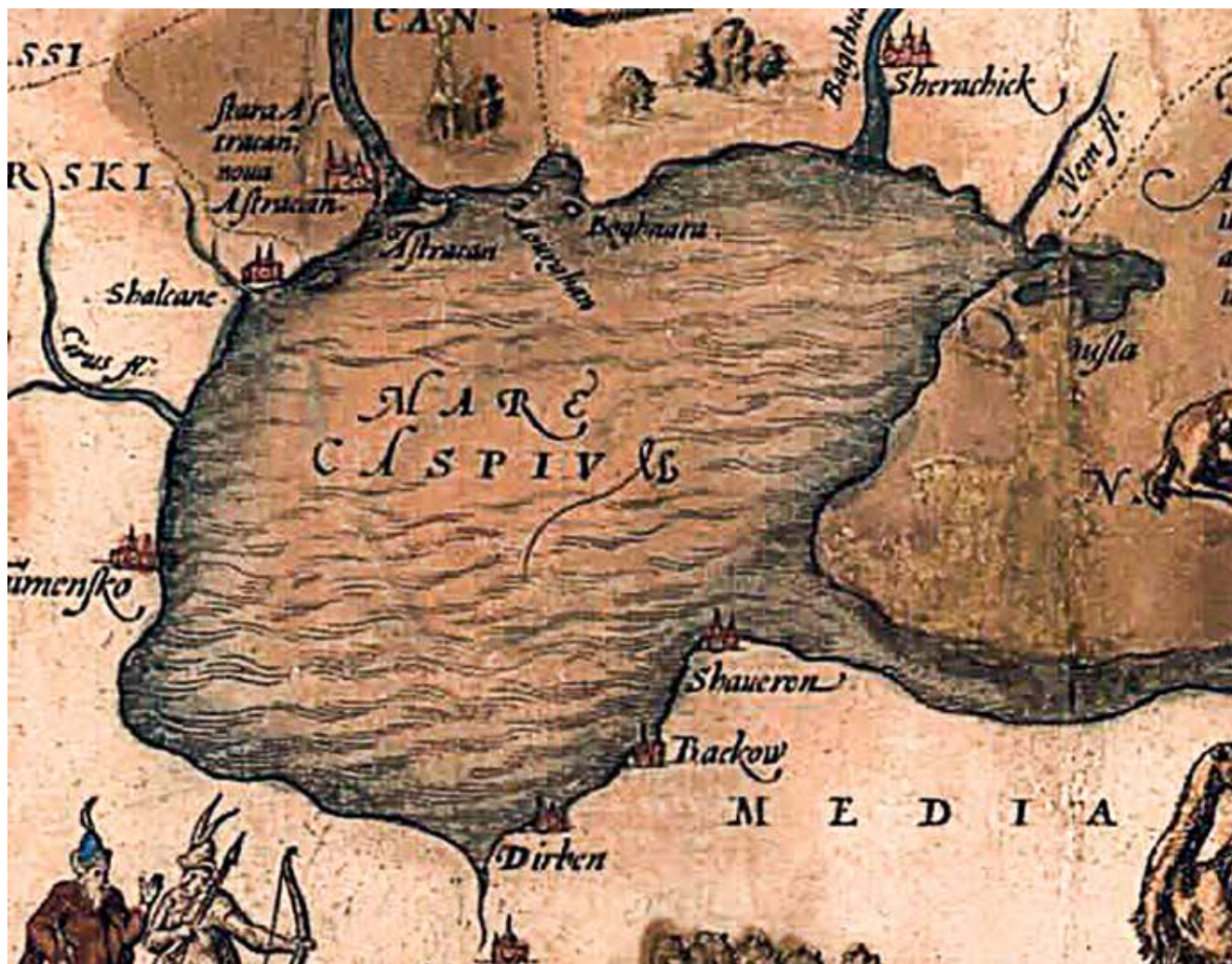
Caspian Sea on a medieval European map. Baku, Derbent and Shirvan are shown as port cities

covering were fastened with vegetable ropes (8, p. 89). The underwater part of the bagala, as well as the she-beke was covered with a special mixture of vegetable fat and lime. The bagala had a continuous deck without superstructures, a sloping stem with a short bowsprit. In Muslim countries, the bagala had been used since the 11 th century, and in the Persian Gulf and the Red Sea they are still common. The size of the bagala: length - up to 30 m, width - up to 5 m, crew (depending on the size of the ship) - up to 25 people (8, p. 89).