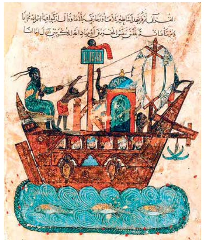
Picture of a ship on a medieval Arab miniature

From the 16 th century, more sophisticated booses, boats, canoes, galleys, etc. began to be widely used in the Caspian. The largest of them were "booses" (a term having Norman or Dutch origin), which were mainly