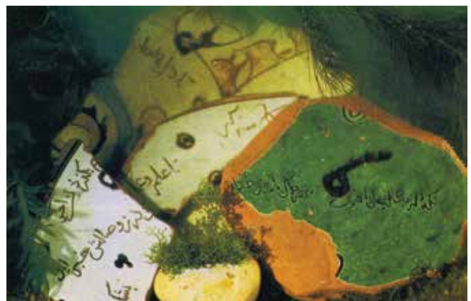
Ceramics fragments with inscriptions. 12-13 th centuries. These were found at sea near Bandovan I village

tran club society from Moscow. The work then was carried out in the waters of the island of Sangi-Mugan (Svinoy) and the exploratory search - on the islands of Yakorniy, Persianina and Los, and Bezymyanniy. They examined a vast area of the sea along the island of Sangi-Mugan and its spit stretching into the sea for 2 miles. On the left and right of the spit, many anchors of different designs and different types were discovered under the water. Over twenty anchors were lifted from the seabed. An interesting find was a grapnel with claws found behind the pier of the island to the east at a depth