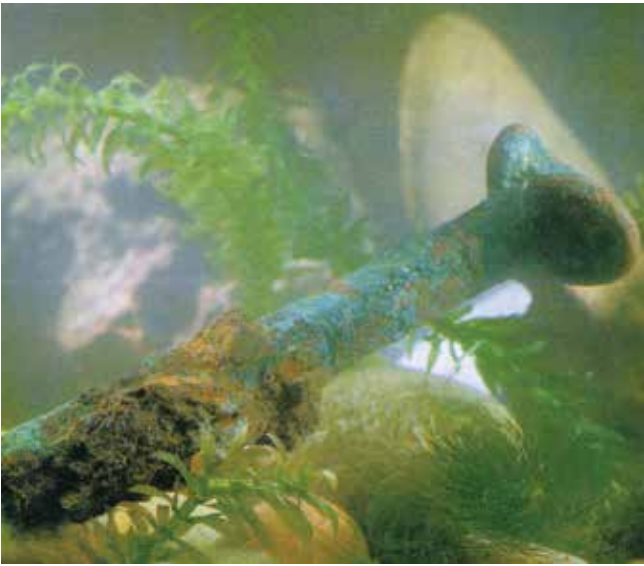
Bronze sword. 8-7 th centuries BC.

the mouth of the Kura River, which was navigable in the middle and lower reaches in antiquity and in the Middle Ages and through which water and land routes passed. Therefore, one would expect traces of settlements at the mouth of the Kura.