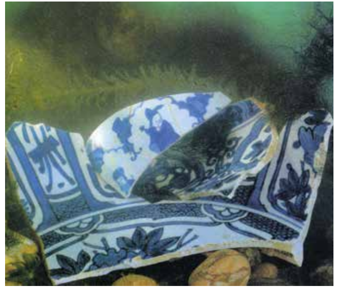
Fragment of the Chinese faience dish. 16-17 th centuries. It was found at sea near Bilgah

In many cups and saucers, the bottom is decorated