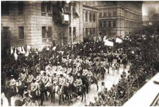
Parade of Azerbaijani army units in March 1919

Republic of Azerbaijan was purely defensive in nature. Further, the government document noted the need to provide the armed forces of the republic with “everything necessary: weapons, ammunition, food, etc”. (3) The declaration also placed considerable emphasis on ensuring the country’s food security and restoring its transport infrastructure, and envisaged a number of practical measures to solve them.