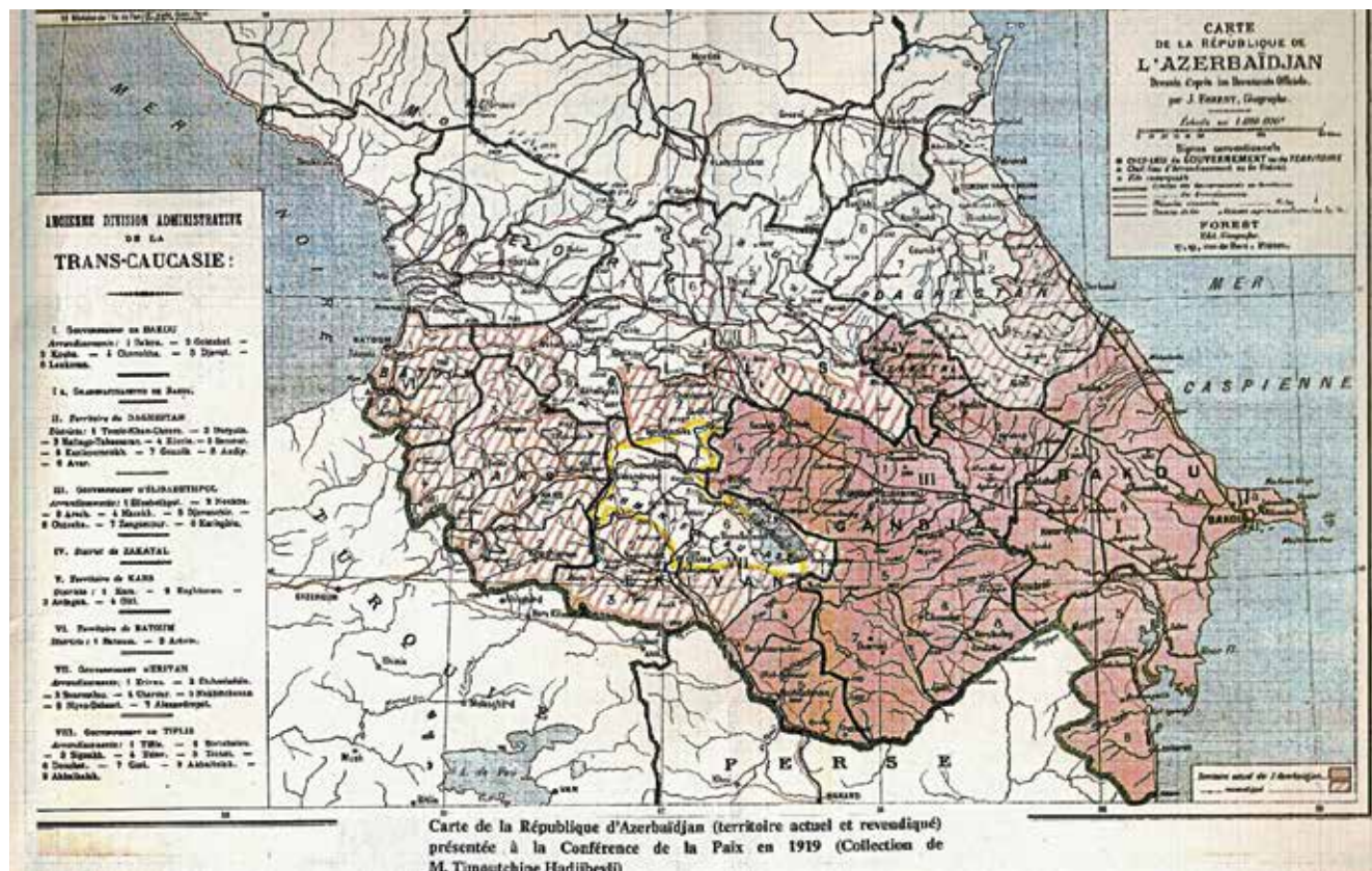
The map of the Azerbaijan Republic presented at the Paris Conference

on an exclusively peaceful settlement of all territorial disputes with neighbors at the negotiating table; - The desire to ensure collective security in the region by forming a union of Caucasian states in confederal or other forms; - Comprehensive development of the economic potential of the republic and, above all, ensuring its food security; - Strengthening of internal political stability, especially in the field of interethnic relations through the strict observance of all democratic norms and freedoms in relation to all national minorities that inhabit the republic; - Suppression of any manifestations of separatist tendencies within the country by all means; - Priority government activities in the field of military building and formation of national armed forces capable of ensuring the territorial integrity of the country. In general, many aspects of the national security concept developed during the first Republic of Azerbaijan have not lost their historical significance and political relevance for Azerbaijan in the 21 st century. 🌟